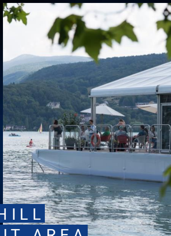
CHILL OUT AREA